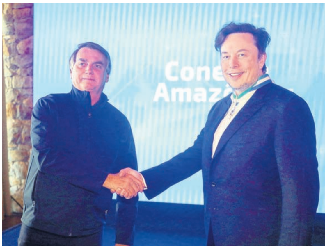
In this handout photo provided by the Ministry of Communication, Brazil's then-President Jair Bolsonaro, left, and Tesla and SpaceX chief executive officer Elon Musk shake hands during a meeting in Porto Feliz, Brazil, May 20, 2022.

In recent years, an estimated 20,000 prospectors contaminated vital waterways with mercury used to separate gold. They have